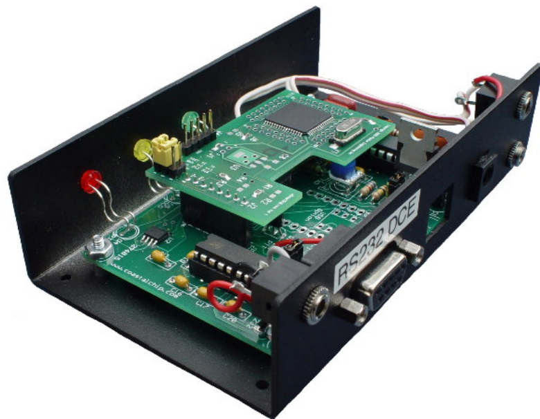
Figure 2. \mu SmartDigi and TNC-X

If a packet PASSes the Rules a new AX.25 HDLC frame is constructed, then a KISS packets is constructed and lastly it is sent to the serial port of the TNC-X for transmission.